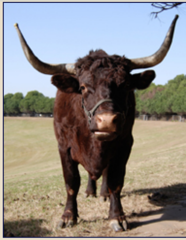
Bill: An American Milking Devon Ox

Wherever your paths may lead, I wish you extraordinary leadership.